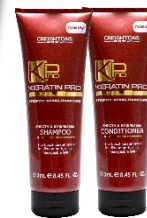
Shampoo & Conditioner